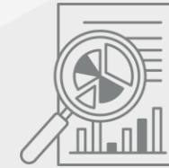
Public Health Reporting