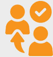
Closed Loop Referrals