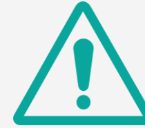
Event Notifications (ENS)