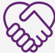
Social Drivers for Health