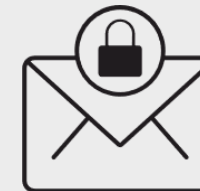
Direct Secure Messaging