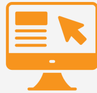
Clinical Query Portal